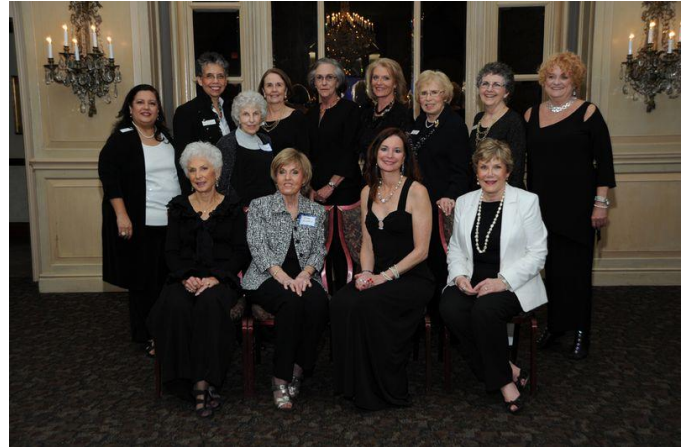
Past and Present EWI Presidents